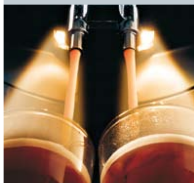
Un jeu pour les sens