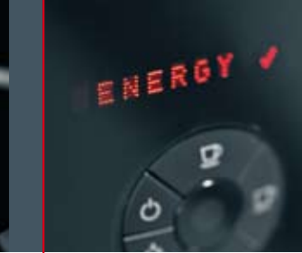
Energy Save Mode (ESM®)