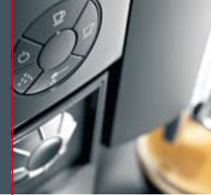
Ultimate enjoyment at the touch of a button