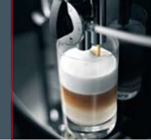
Cappuccino at the touch of a button